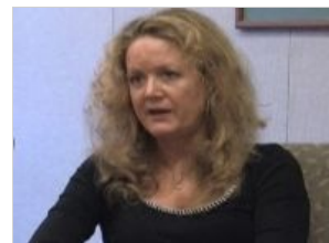
Nine years with NXIVM