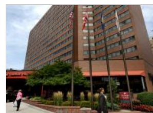
Aging Albany hotel faces gray future