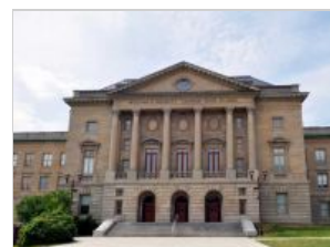
Hackett report sees deep flaws